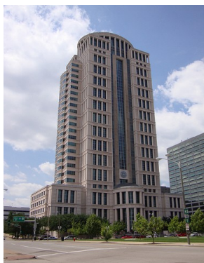
Thomas Eagleton Federal Courthouse. It is the largest courthouse in the country.